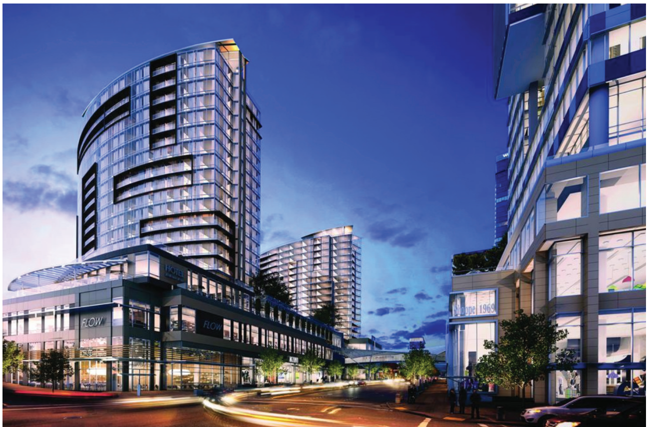
Bellevue Square Shopping Center Expansion – Bellevue, Washington

Collectively, our staff offers strong experience planning and designing national chain hotels, tribal casinos and resorts, as well as boutique, luxury, and historic developments.