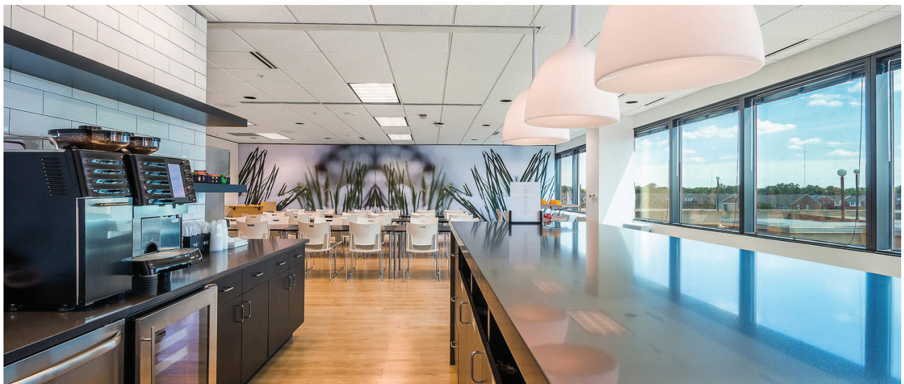
YAHOO! DATA CENTER – DETROIT, MICHIGAN

We make it our priority to work closely with our clients, constantly listening to the needs of both tenants and owners. Because priorities and technology can frequently change, we are adept at receiving direction and developing tailored solutions within short timelines.